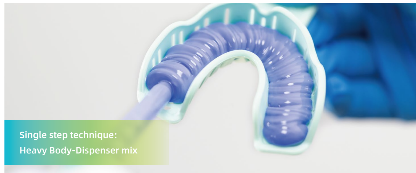
Single step technique: Heavy Body-Dispenser mix

PERFIT heavy body is a high viscosity VPS material to offer preliminary impression material with excellent carving properties. The advanced thixotropic characteristics makes PERFIT heavy body an ideal impression tool especially the implantology. Dispenser and auto mixing method provides more choice, combined with light body could offer high precision impression to meet all clinical demands.