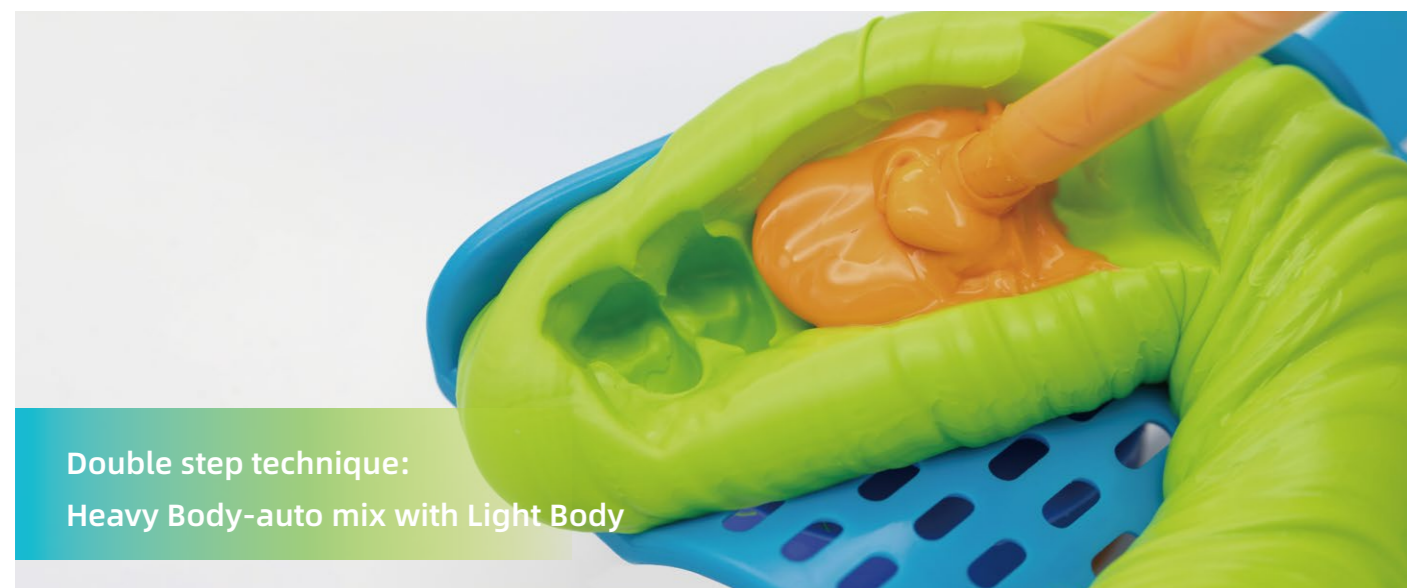
Double step technique: Heavy Body-auto mix with Light Body