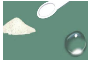
3. Take powder and liquid, mixing ratio 1:1