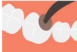
6. Waterproof treatment