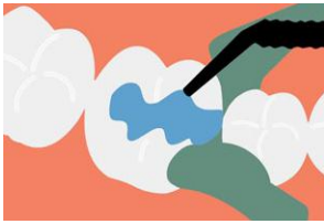
1. Prepare the tooth