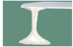
4. Mix the powder and liquid