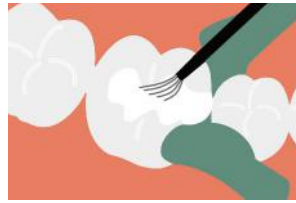
2. Apply the conditioner