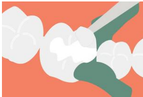
5. Fill and trim